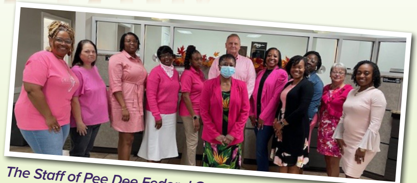
The Staff of Pee Dee Federal Credit Union PINKED OUT for breast cancer awareness.